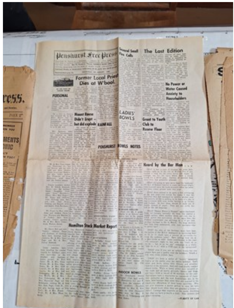
Above: The final Penshurst Free Press, edition, Jan 19, 1980.