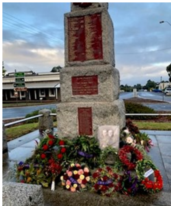
Right: Peshurst Cenotaph on a rainy Anzac Morning.