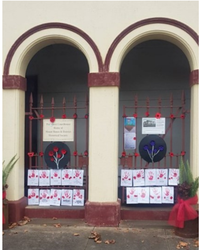
Above: ANZAC Day Tribute on the Gates of the Peshurst Court House