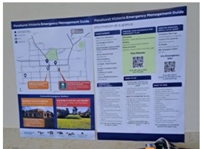
Above: Draft Emergency Management Guide

provide a community level blueprint for residents and visitors in the event of an emergency, and information to assist residents in developing their individual level emergency plans. This guide has had input from CFA, Vicpol and the WDHS Penshurst campus and is cited within the Municipal Emergency Plan. Having this town level emergency guide in place increases the opportunity for funding to continue to upgrade the Hall over time. One of the key priorities is to raise funds for a generator to provide a back-up power option in the event that the town loses power in an emergency event. The committee is proud of creating this Guide given it is one of the first townships in the Shire to do so.