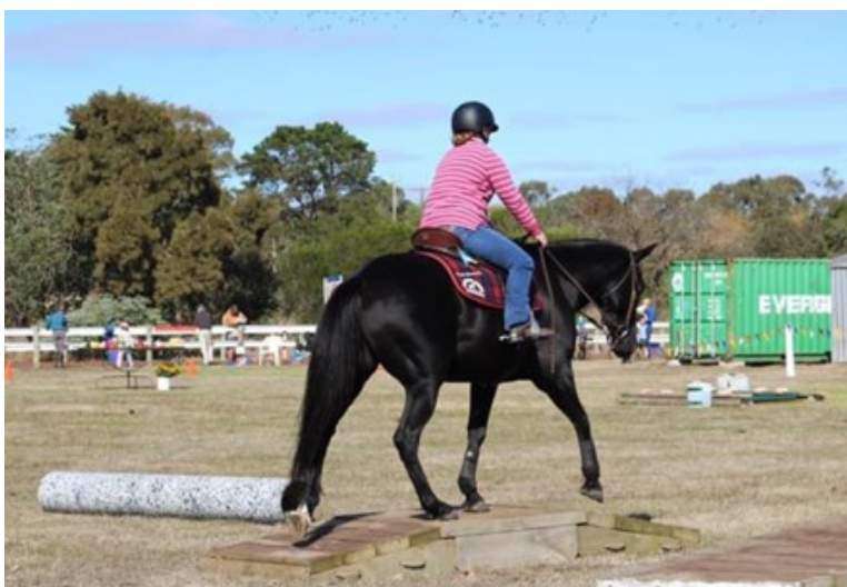
The Picaninny ring was popular with the under 10 age group. (see page 6)